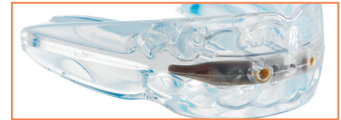
Reinforcement with hard incisal surfaces.

New features: Incisal reinforcement for deep bite | Narrow and wide versions for different arch forms | Highest surface quality (A-1, SPI AR-106)