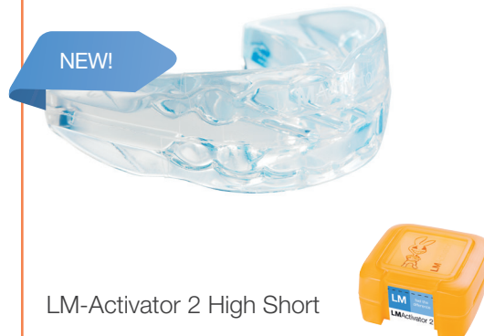
LM-Activator 2 High Short

Model with a shorter molar section for patients whose second molars have not yet erupted. Delivered in an orange box. The High-model of LM-Activator is thicker in the region of second premolars and molars. It is specifically designed for treating skeletal and dentoalveolar open bite cases.