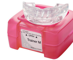
LM-Trainer Medium LM 94100T