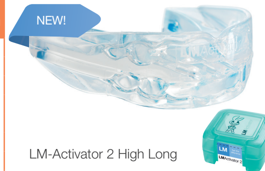
LM-Activator 2 High Long

Model with a longer molar section for patients whose second molars have erupted. Delivered in a green box. The High-model of LM-Activator is thicker in the region of second premolars and molars. It is specifically designed for treating skeletal and dentoalveolar open bite cases.