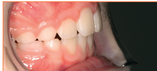
After 1 year