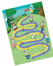
Patient motivational material LM 94531 poster & stickers 15 pcs - A wall poster for tracking daytime and night-time use. It features a game-like progress path on which stickers are placed daily as recognition of successful use.