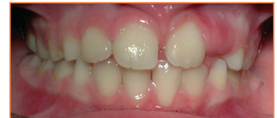
After 15 days