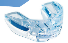
LM-Trainer 2 M LM 94100T2