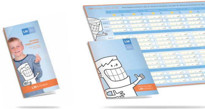
LM-Activator clinic marketing brochure M1061EN

Patient compliance is essential for successful treatment. The first month is crucial in adopting the habit to use the appliance (because creating a habit in general requires 3-4 weeks of regularity). To motivate the patient and his/her family, age appropriate material is available for both preadolescents and adolescents. It is important to make sure the patient and his/her family understands that irregular use may be equivalent with no treatment at all.