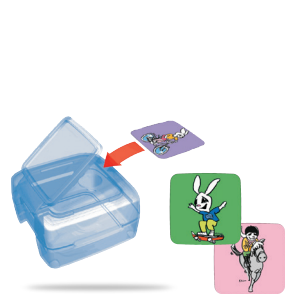
Reward cards LM 94511 Skateboard 65 pcs LM 94512 Football/Soccer 65 pcs LM 94513 Bicycle 65 pcs LM 94514 Horse and rider 65 pcs