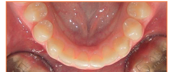
After 10 months