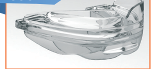
LM-Trainer Braces 2 S 94100TB2S