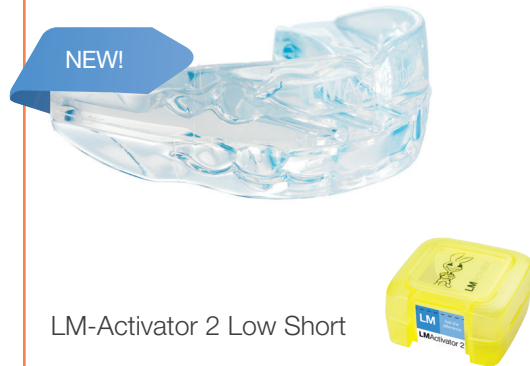
LM-Activator 2 Low Short

Model with a shorter molar section for patients whose second molars have not yet erupted. Delivered in a yellow box.