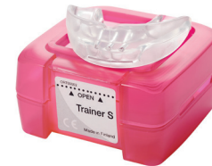
LM-Trainer Small LM 94100S