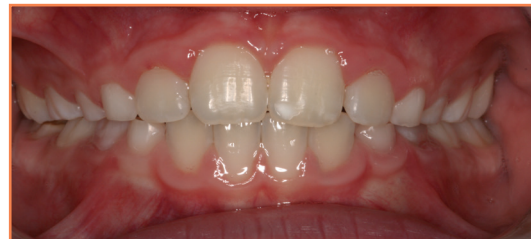
After 1 year