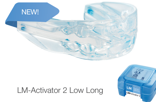
LM-Activator 2 Low Long

Model with a longer molar section for patients whose second molars have erupted. Delivered in a blue box.