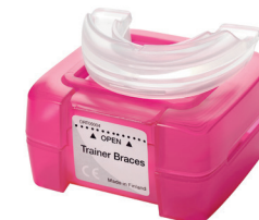
LM-Trainer Braces LM 94100TB